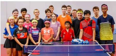
The training group